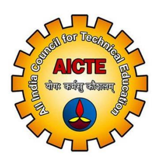
All India Council for Technical Education (AICTE)