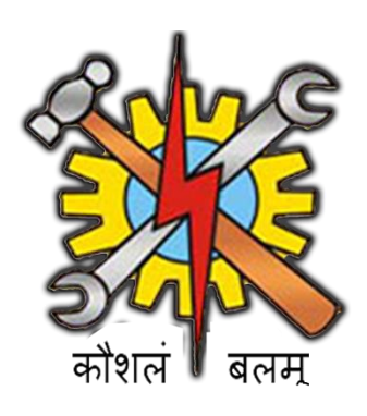
National Council of Vocational Training (NCVT)